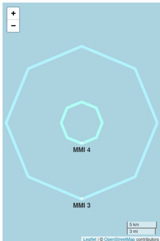
Figure 2. Polygons show the largest contours of estimated shaking intensity. Shaking of MMI 3 or less is often not felt. Star shows the ANSS earthquake epicenter.