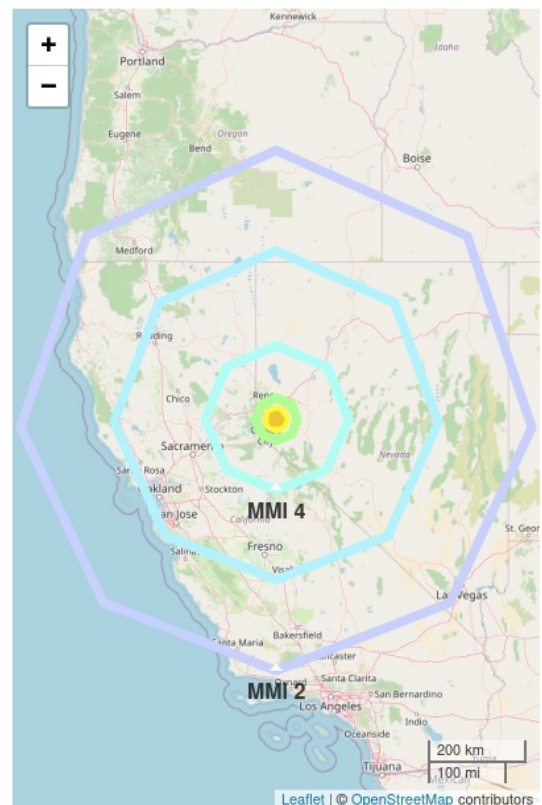
Figure 2. Polygons show the largest contours of estimated shaking intensity. Shaking of MMI 3 or less is often not felt. ANSS earthquake epicenter not available.

Report created 2025-12-04 08:12:10 (Pacific)