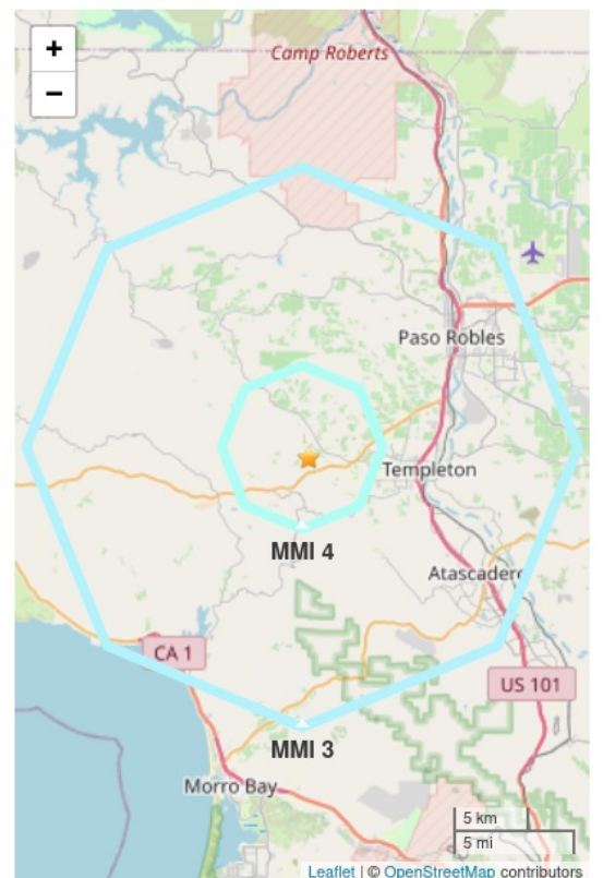
Figure 2. Polygons show the largest contours of estimated shaking intensity. Shaking of MMI 3 or less is often not felt. Star shows the ANSS earthquake epicenter.

Report created 2025-12-12 15:35:38 (Pacific)