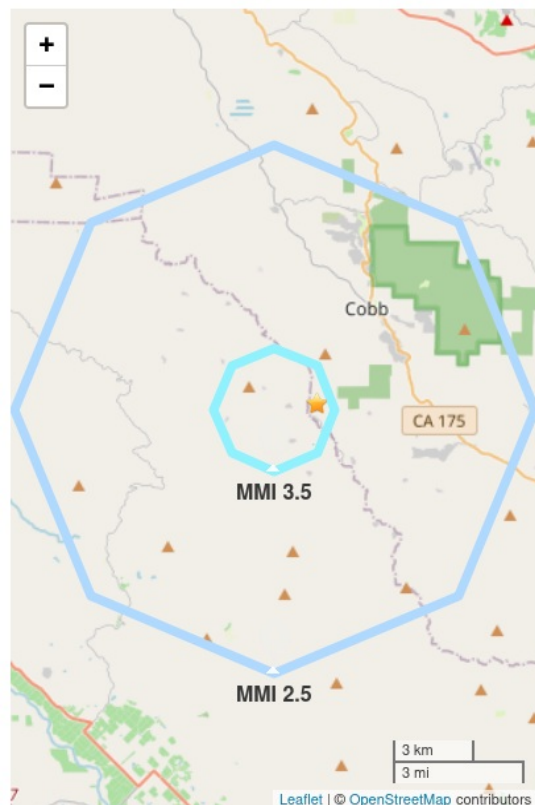
Figure 2. Polygons show the maximum estimated extent of ground shaking for different MMI** ranges (color-coded and labeled). Shaking of MMI 3 or less is often not felt. Orange star shows the ANSS earthquake location.

Report created 2026-04-25 01:05:18 (Pacific)