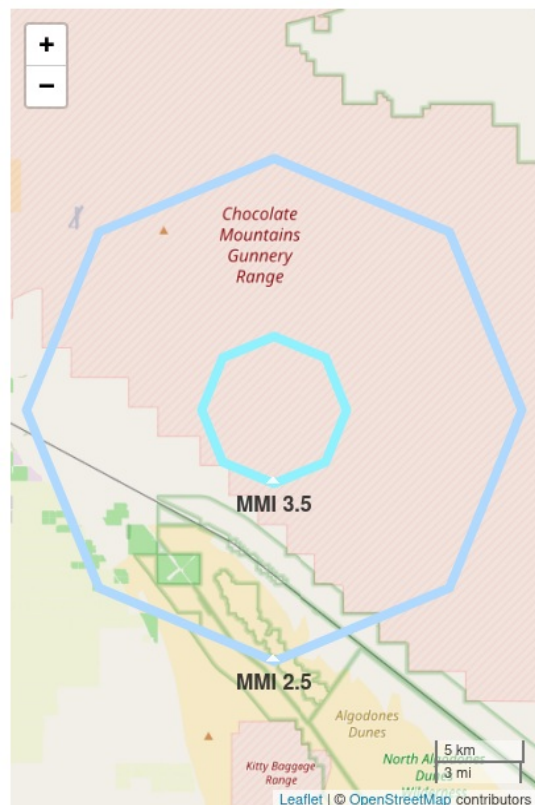
Figure 2. Polygons show the maximum estimated extent of ground shaking for different MMI** ranges (color-coded and labeled). Shaking of MMI 3 or less is often not felt. Orange star shows the ANSS earthquake location.