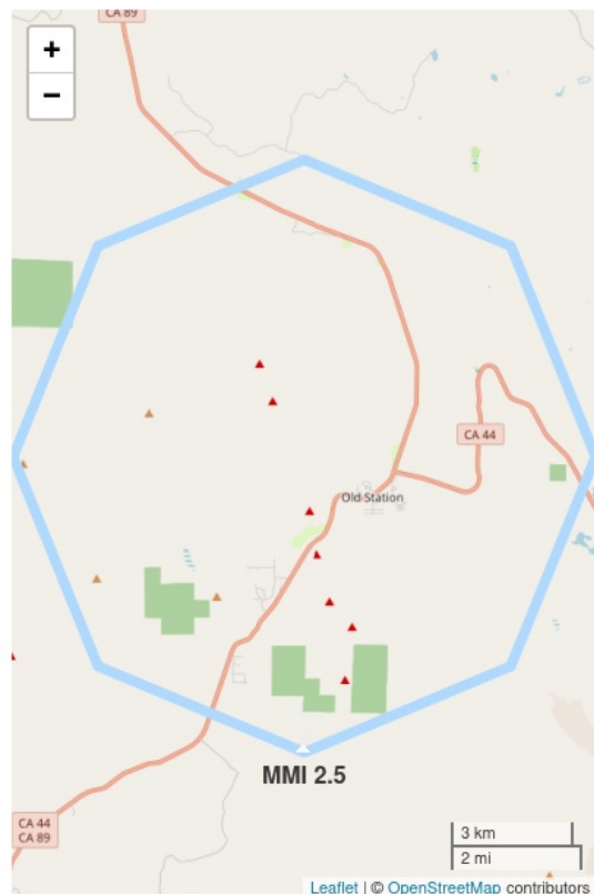
Figure 2. Polygons show the maximum estimated extent of ground shaking for different MMI** ranges (color-coded and labeled). Shaking of MMI 3 or less is often not felt. Orange star shows the ANSS earthquake location.