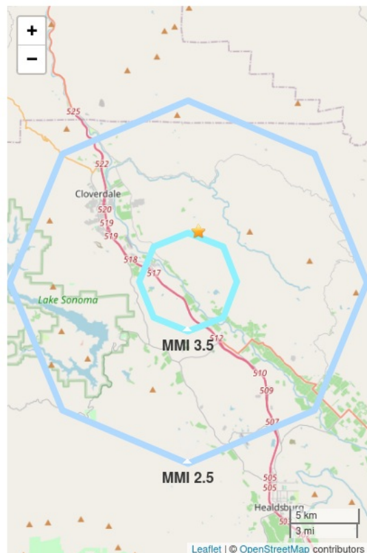
Figure 2. Polygons show the maximum estimated extent of ground shaking for different MMI** ranges (color-coded and labeled). Shaking of MMI 3 or less is often not felt. Orange star shows the ANSS earthquake location.