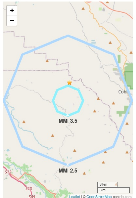
Figure 2. Polygons show the maximum estimated extent of ground shaking for different MMI** ranges (color-coded and labeled). Shaking of MMI 3 or less is often not felt. Orange star shows the ANSS earthquake location.