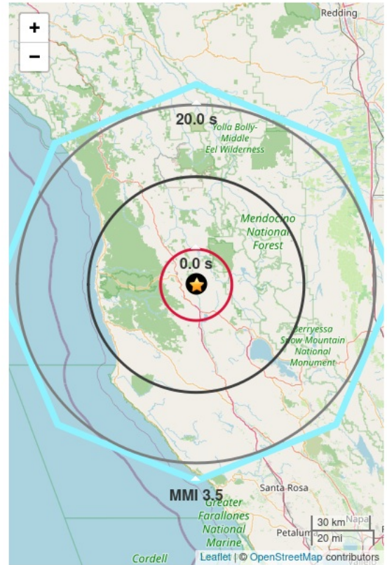
Figure 1. Initial earthquake locations from ShakeAlert (black dot) and ANSS (orange star). Polygon shows estimated area of MMI 3.5 and greater ground shaking**. Red circle (if shown) marks the position of the peak shaking wavefront at the time the Alert Message was issued***. Note, shaking takes 10 seconds to expand from circle to circle.

To learn more about ShakeAlert®, visit www.shakealert.org/FAQ