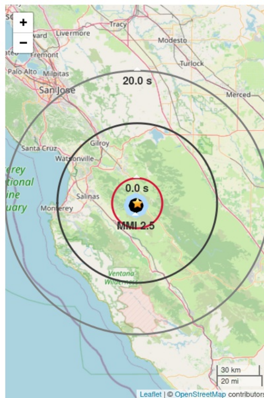
Figure 1. Initial earthquake locations from ShakeAlert (black dot) and ANSS (orange star). Polygon shows estimated area of felt ground shaking**. Red circle (if shown) marks the position of the peak shaking wave front at the time the Alert Message was issued***. Note, shaking takes 10 seconds to expand from circle to circle.

To learn more about ShakeAlert®, visit www.shakealert.org/FAQ