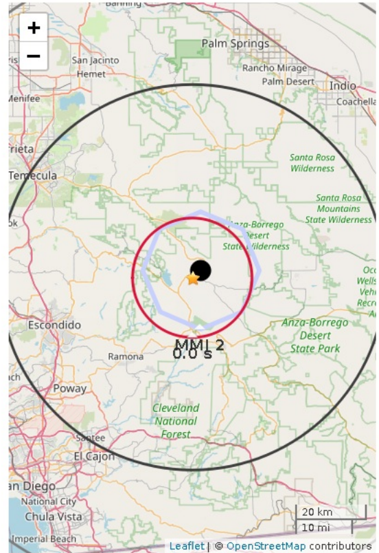
Figure 1. ShakeAlert initial earthquake location (black dot). Star is regional network epicenter. Polygon is the predicted outer range for felt ground motion (MMI 2). Red circle is front of peak shaking when the alert was released. Shaking takes 10 s to expand from circle to polygon.

To learn more about ShakeAlert®, visit www.shakealert.org/FAQ