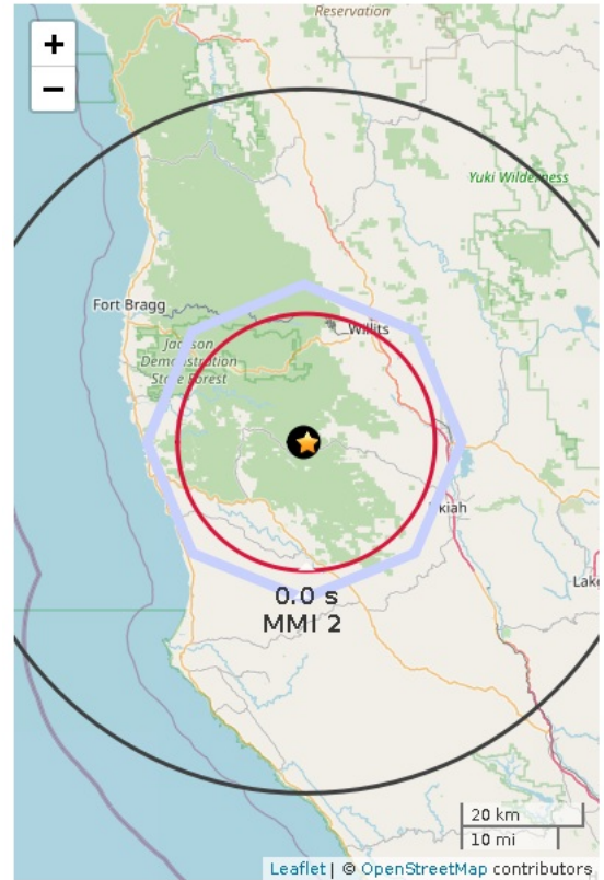
Figure 1. ShakeAlert initial earthquake location (black dot). Star is regional network epicenter. Polygon is the approximate outer range for felt ground motion. If shown***, red circle is front of peak shaking when the alert was released. Shaking takes 10 s to expand from circle to circle.

To learn more about ShakeAlert®, visit www.shakealert.org/FAQ