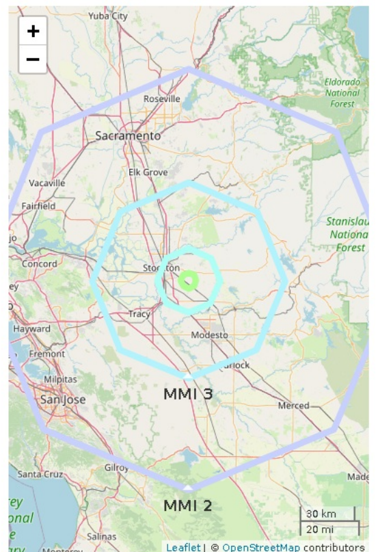
Figure 2. Polygons show shaking intensity contours for the peak magnitude ShakeAlert. Shaking of intensity 3 or less is often not felt. Regional network epicenter not available.