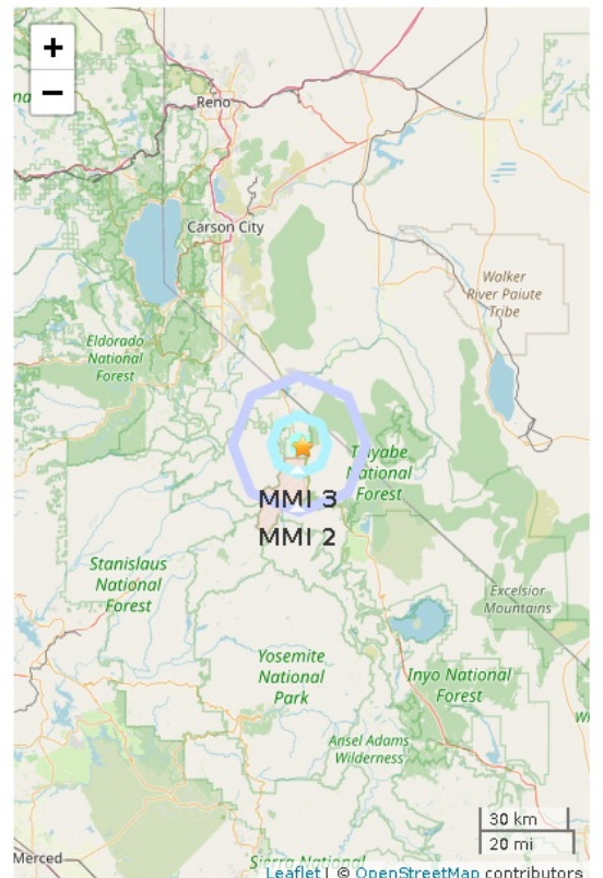
Figure 2. Polygons show shaking intensity contours for the peak magnitude ShakeAlert. Shaking of intensity 3 or less is often not felt. Star shows the regional network epicenter.