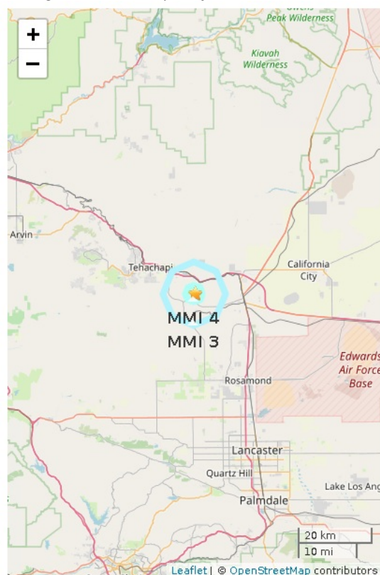
Figure 2. Polygons show shaking intensity contours for the peak magnitude estimate. Shaking of MMI 3 or less is often not felt. Star shows the ANSS earthquake epicenter.

Report created 2021-10-01 18:47:30 (Pacific)