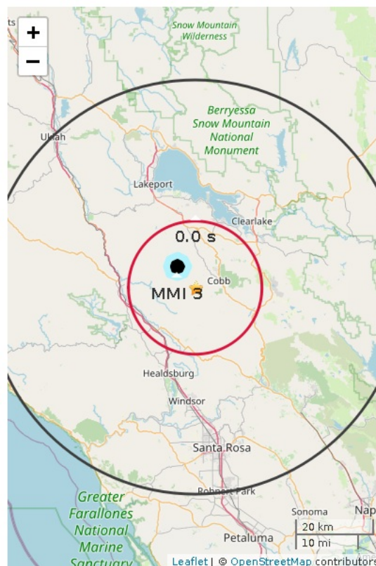
Figure 1. ShakeAlert initial earthquake location (black dot). Star is ANSS earthquake epicenter. Polygon approximates the outer range for felt ground motion. If shown, red circle is front of peak shaking when the message was released***. Shaking takes 10 s to expand from circle to circle.

To learn more about ShakeAlert®, visit www.shakealert.org/FAQ