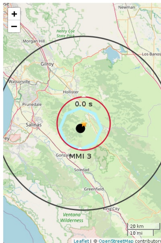
Figure 1. ShakeAlert initial earthquake location (black dot). Star is ANSS earthquake epicenter. Polygon approximates the outer range for felt ground motion. If shown, red circle is front of peak shaking when the message was released***. Shaking takes 10 s to expand from circle to circle.

To learn more about ShakeAlert®, visit www.shakealert.org/FAQ