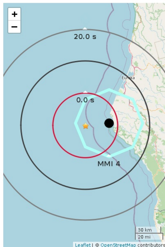
Figure 1. ShakeAlert initial earthquake location (black dot). Star is ANSS earthquake epicenter. Polygon shows estimated MMI 4 shaking intensity area. If shown, red circle is front of peak shaking when the message was released***. Shaking takes 10 s to expand from circle to circle.

To learn more about ShakeAlert®, visit www.shakealert.org/FAQ