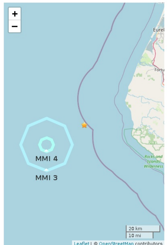
Figure 2. Polygons show shaking intensity contours for the peak magnitude estimate. Shaking of MMI 3 or less is often not felt. Star shows the ANSS earthquake epicenter.

Report created 2021-12-20 12:52:57 (Pacific)