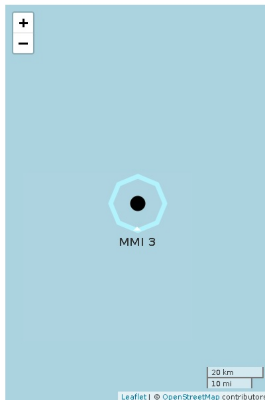
Figure 1. ShakeAlert initial earthquake location (black dot). ANSS earthquake epicenter not available. Polygon approximates outer range for felt ground motion. If shown, red circle is front of peak shaking when the message was released***. Shaking takes 10 s to expand from circle to circle.

To learn more about ShakeAlert®, visit www.shakealert.org/FAQ