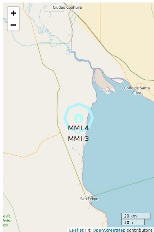
Figure 2. Polygons show shaking intensity contours for the peak magnitude estimate. Shaking of MMI 3 or less is often not felt. ANSS earthquake epicenter not available.

Report created 2022-02-18 14:48:10 (Pacific)