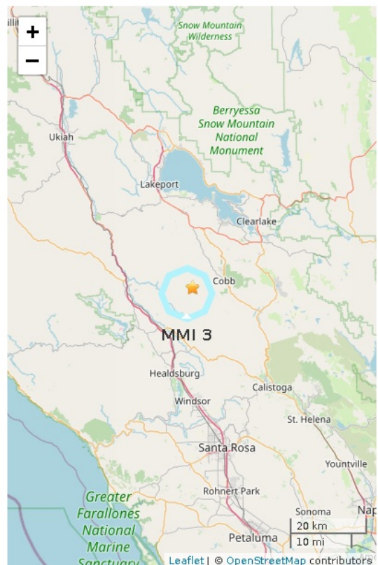
Figure 2. Polygons show shaking intensity contours for the peak magnitude estimate. Shaking of MMI 3 or less is often not felt. Star shows the ANSS earthquake epicenter.

Report created 2022-04-17 19:14:16 (Pacific)