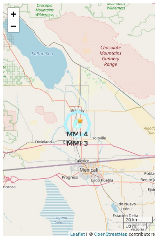
Figure 2. Polygons show shaking intensity contours for the peak magnitude estimate. Shaking of MMI 3 or less is often not felt. Star shows the ANSS earthquake epicenter.

Report created 2022-04-19 22:24:53 (Pacific)