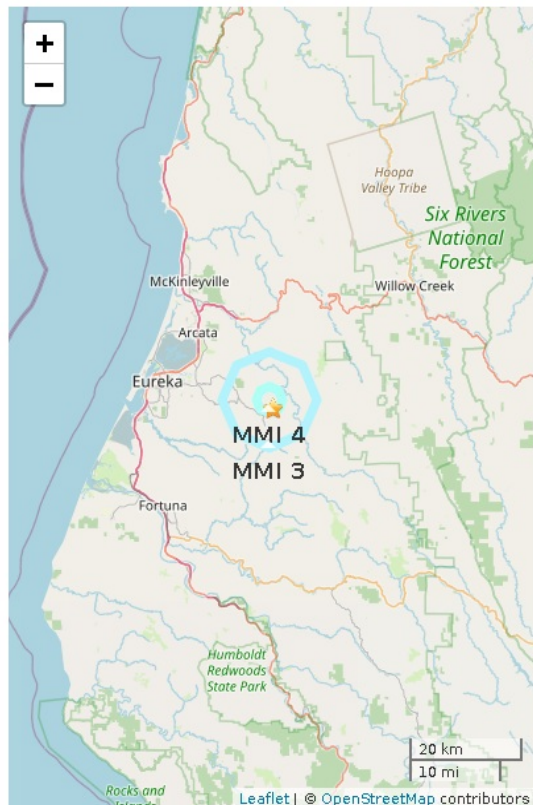
Figure 2. Polygons show shaking intensity contours for the peak magnitude estimate. Shaking of MMI 3 or less is often not felt. Star shows the ANSS earthquake epicenter.