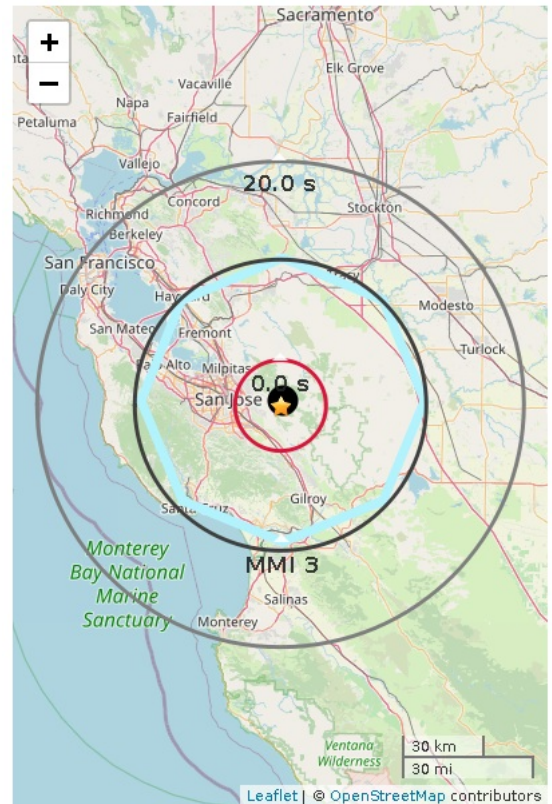
Figure 1. ShakeAlert initial earthquake location (black dot). Star is ANSS earthquake epicenter. Polygon approximates the outer range for felt ground motion. If shown, red circle is front of peak shaking when the message was released***. Shaking takes 10 s to expand from circle to circle.

To learn more about ShakeAlert®, visit www.shakealert.org/FAQ