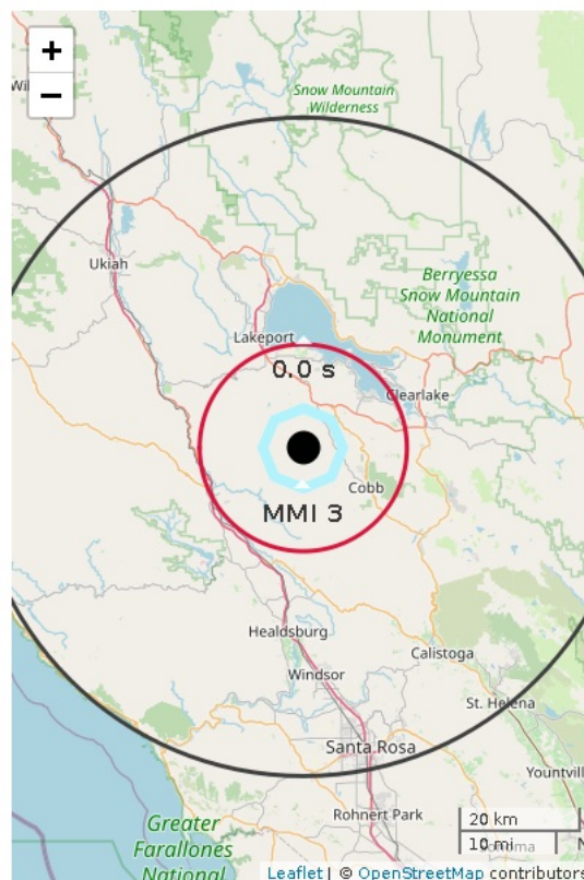
Figure 1. ShakeAlert initial earthquake location (black dot). ANSS earthquake epicenter not available. Polygon approximates outer range for felt ground motion. If shown, red circle is front of peak shaking when the message was released***. Shaking takes 10 s to expand from circle to circle.

This information is provisional and subject to revision. It is being provided to meet the need for timely best science. The information has not received final approval by the U.S. Geological Survey (USGS) and is provided on the condition that neither the USGS nor the U.S. Government shall be held liable for any damages resulting from the authorized or unauthorized use of the information.