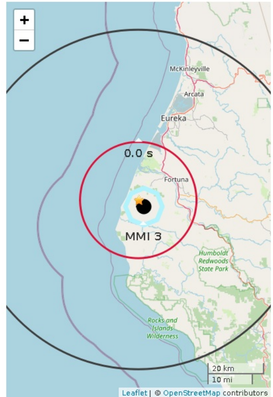
Figure 1. ShakeAlert initial earthquake location (black dot). Star is ANSS earthquake epicenter. Polygon approximates the outer range for felt ground motion. If shown, red circle is front of peak shaking when the message was released***. Shaking takes 10 s to expand from circle to circle.

To learn more about ShakeAlert®, visit www.shakealert.org/FAQ