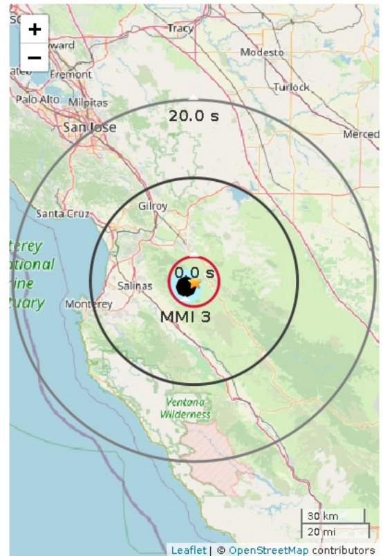
Figure 1. ShakeAlert initial earthquake location (black dot). Star is ANSS earthquake epicenter. Polygon approximates the outer range for felt ground motion. If shown, red circle is front of peak shaking when the message was released***. Shaking takes 10 s to expand from circle to circle.

To learn more about ShakeAlert®, visit www.shakealert.org/FAQ