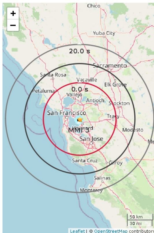
Figure 1. ShakeAlert initial earthquake location (black dot). Star is ANSS earthquake epicenter. Polygon approximates the outer range for felt ground motion. If shown, red circle is front of peak shaking when the message was released***. Shaking takes 10 s to expand from circle to circle.

To learn more about ShakeAlert®, visit www.shakealert.org/FAQ